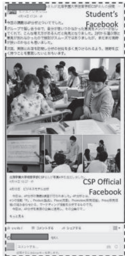
Figure 3. A Student's Facebook Page

Students can add a sentence to the status shared on their Facebook page. They can share statuses on the CSP Official Facebook page. Hence, adding sentences enables students to generate their own "Reflective Journals." The arrow line from "(1) Portfolios" to "(2) Reflective Journals" in figure 2 shows this